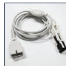
Multisite SpO2 Probe Item Code: B-SP02-V