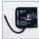
*Reusable NIBP Child Cuff Cuff Size Range: 20.5 to 28.5cm Item Code: B-CCUFF