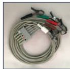
*5-Lead Vet ECG Cable Item Code: B-WIRE5-N