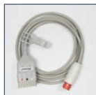
3-Lead ECG Extension Cable Item Code: B-CBL-N