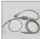
Esophageal Probe with 3-Lead ECG and Temperature(XS/S/M) Item Code: B-EPRB-XS/S/M