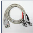
3-Lead Vet ECG Cable Item Code: B-WIRE-N