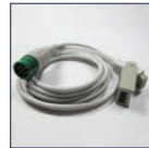
SpO2 Extension Cable Item Code: B-SPCBL-N