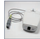
*LOFLO Sidestream CO2 Sensor Item Code: B-RSCO2-V