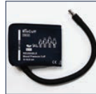
Reusable NIBP Infant Cuff Cuff Size Range: 9 to 14.8cm Item Code: B-ICUFF