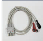
*3-Lead ECG Snap Cable Item Code: B-WIRE-SA