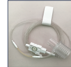
*Sidestream Airway Adapter Kit with Sampling Line -Adult/Pediatric Item Code: 3473ADU-00