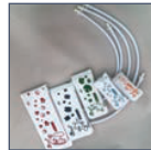
Disposable NIBP Neonate Cuff (Size #1- #5) Item Code: B-NCUFF1~5