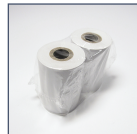
Print Paper Item Code: BM-PP (Not Available for BM1Vet)