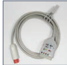
*5-Lead ECG Extension Cable Item Code: B-CBL5-N