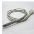
Transflectance SpO2 Probe (10 feet) Item Code: OXY-SP02-R