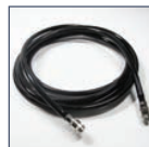
NIBP Extension Tube (3m) Item Code: B-NBPCBL