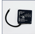
*Reusable NIBP Pediatric Cuff Cuff Size Range: 13.8 to 21.5cm Item Code: B-PCUFF