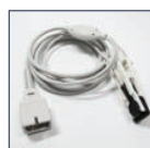
Multisite SpO2 Probe (10 feet) Item Code: OXW-SP02-V