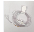
*Sidestream Sampling Line with Male Luer Adapter Item Code: 3475-00