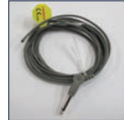
Temperature Probe (Rectal/Esophageal) Item Code: TEM-PRV-R