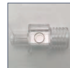
*Mainstream Disposable Adult Airway Adapter: ET Tube > 4mm Item Code: 6063-00