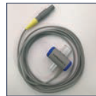
*CAPNOSTAT5 Mainstream CO2 Sensor Item Code: B-RMCO2