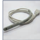
Transflectance SpO2 Probe Item Code: B-SP02-R